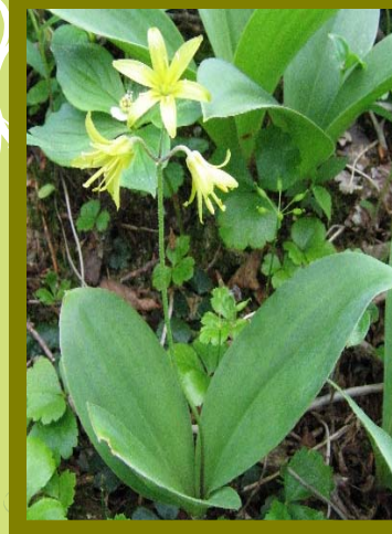
Blue bead lily