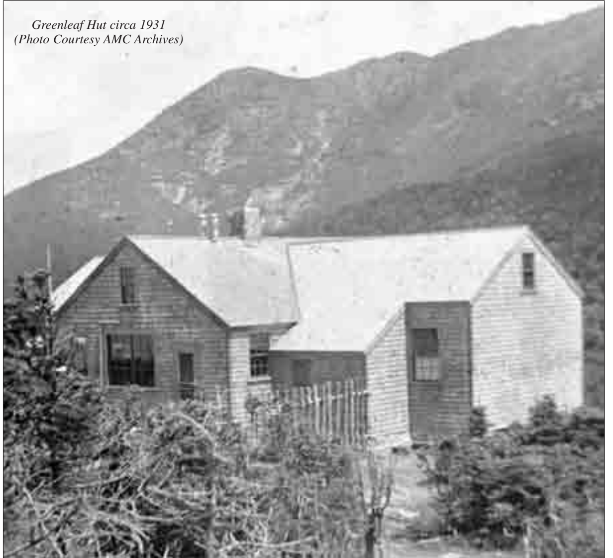
Greenleaf Hut circa 1931

Let's start by saying that each of the eight Appalachian Mountain Club huts has its devoted fans. It has always been that way. Be it "cruo" or guest, each individual forms a personal affinity for one hut or another. The logbooks are brimming with pride-filled accounts of indelible experiences that each generation took away with them.