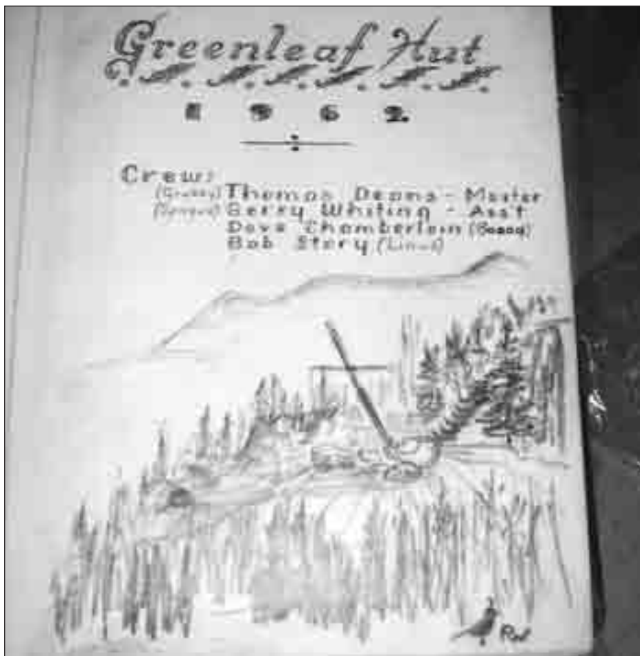
left: Greenleaf Hut log books

we ran up the mountain to rescue the other boy, who was quite sick. Kenny reached him first, followed by the rest of da croo with blankets, first aid gear, pack frames and ropes. The storm cleared for an instant while we improvised a litter of pack frames, supported by a net of climbing ropes.