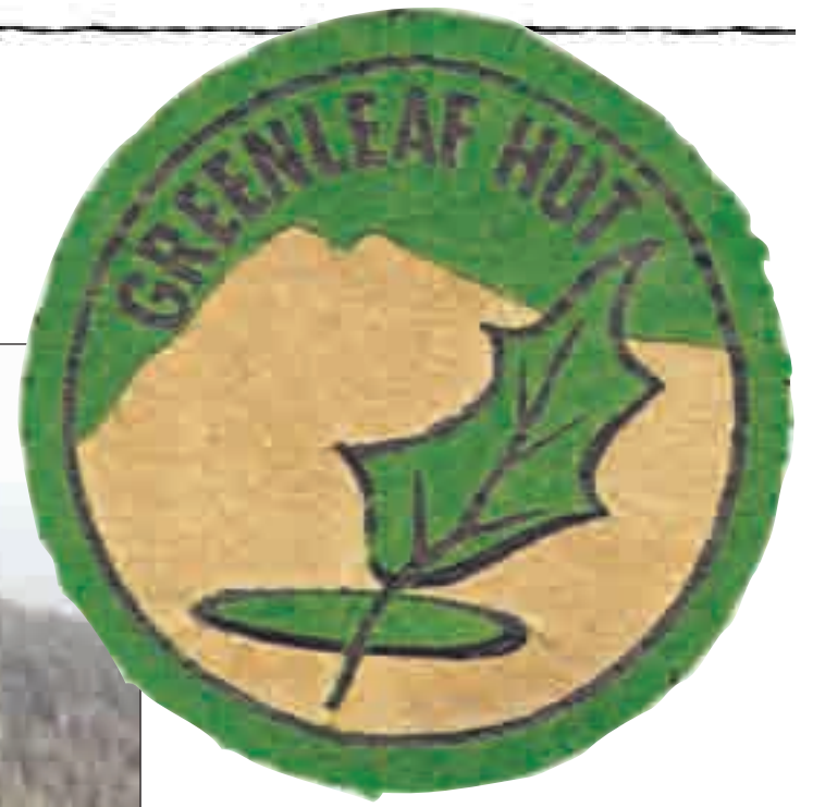
above: Greenleaf Hut Patch