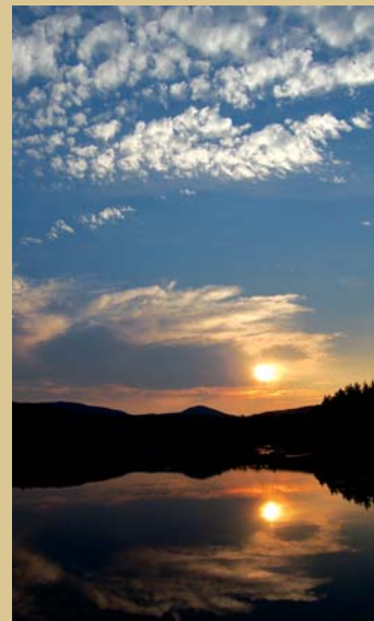
Sunset at Upper Lyford Pond